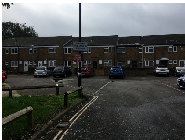
View of the site from the north west boundary