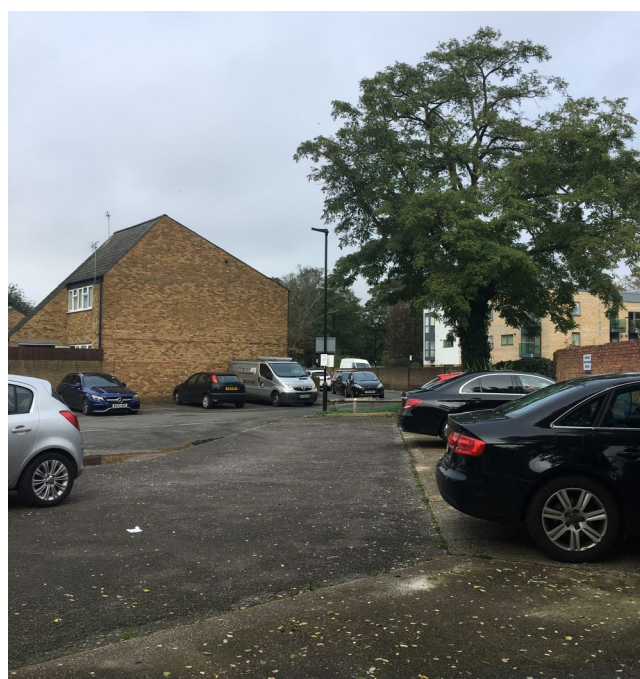
View of the site from the south east boundary